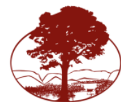
Rothiemurchus United Kingdom