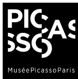
Musée national Picasso-Paris France