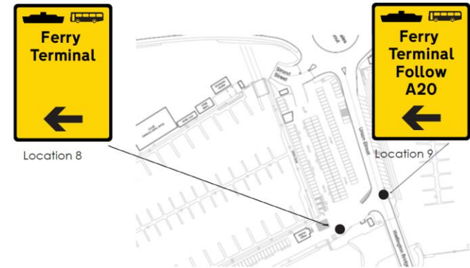
Location 8&9: Union Street Car Parking