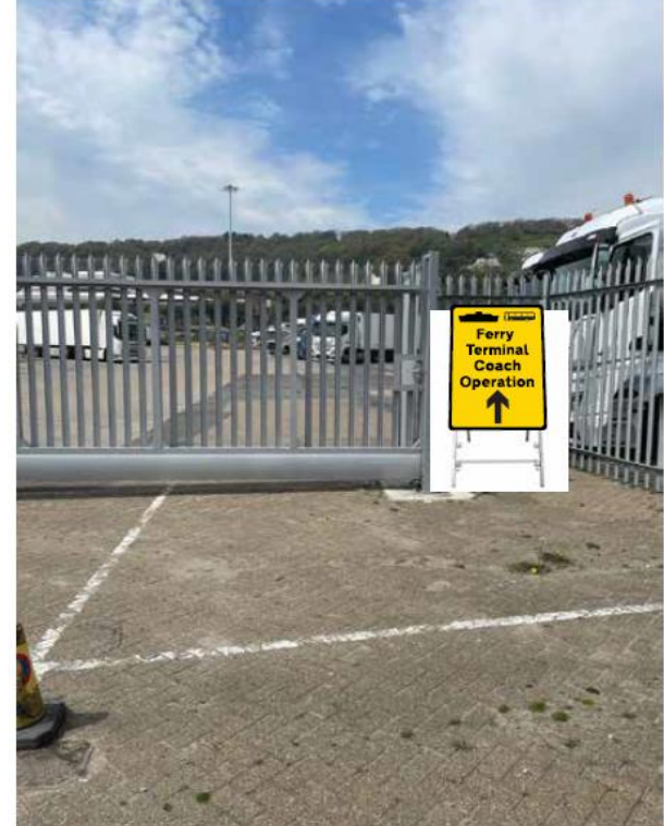
Location 4: Exit Pink Car Park