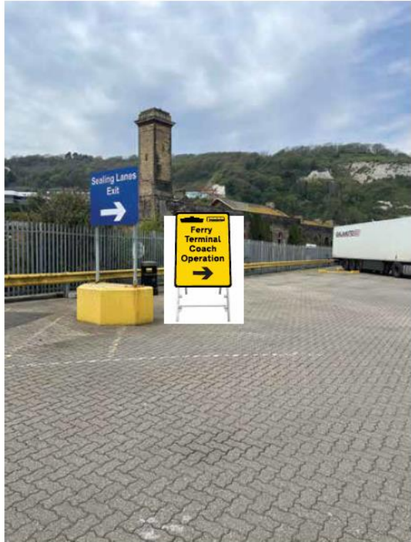
Location 5: Motis Yard