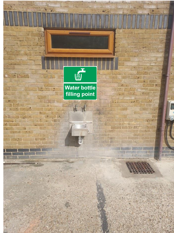
Location 7: Boatyard Water filling