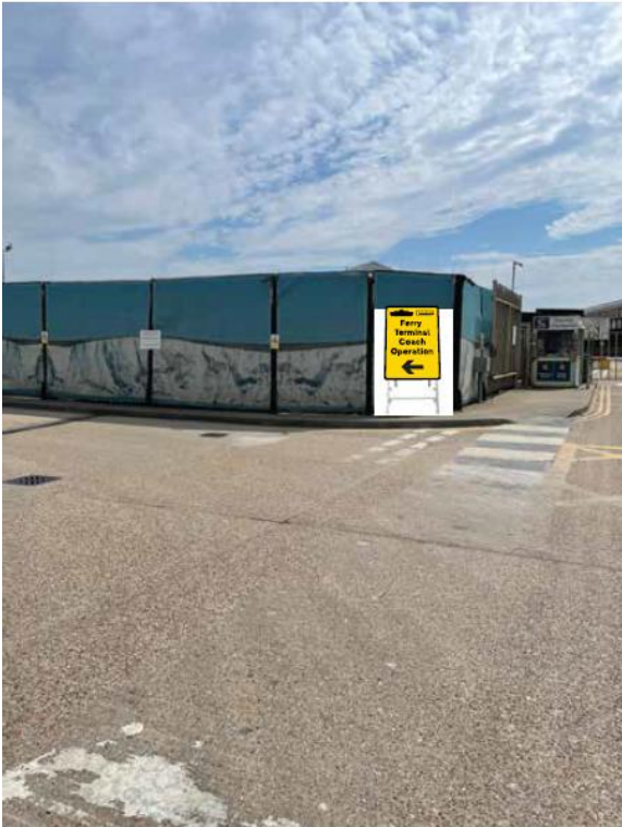
Location 1: Junction Gate Cruise Terminal