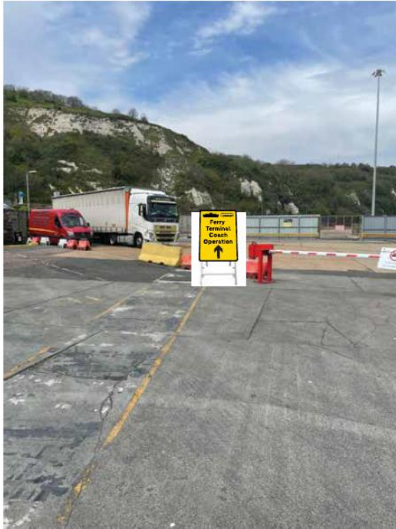
Location 6: DVSA Car Parking