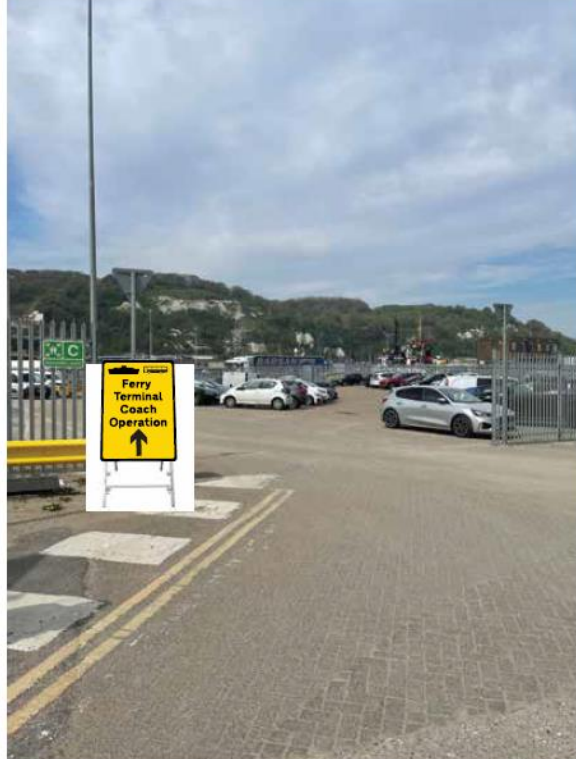
Location 3: Pink Car Park Entrance