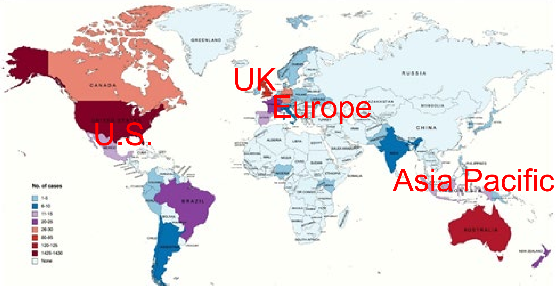
Figure 1.2. Number of climate litigation cases around the world, per jurisdiction (up to 31 May 2022)

Notes: Cumulative figures to May 2022. This figure only includes cases filed before national tribunals. The 103 cases filed before 15 international and regional bodies entities are not included.